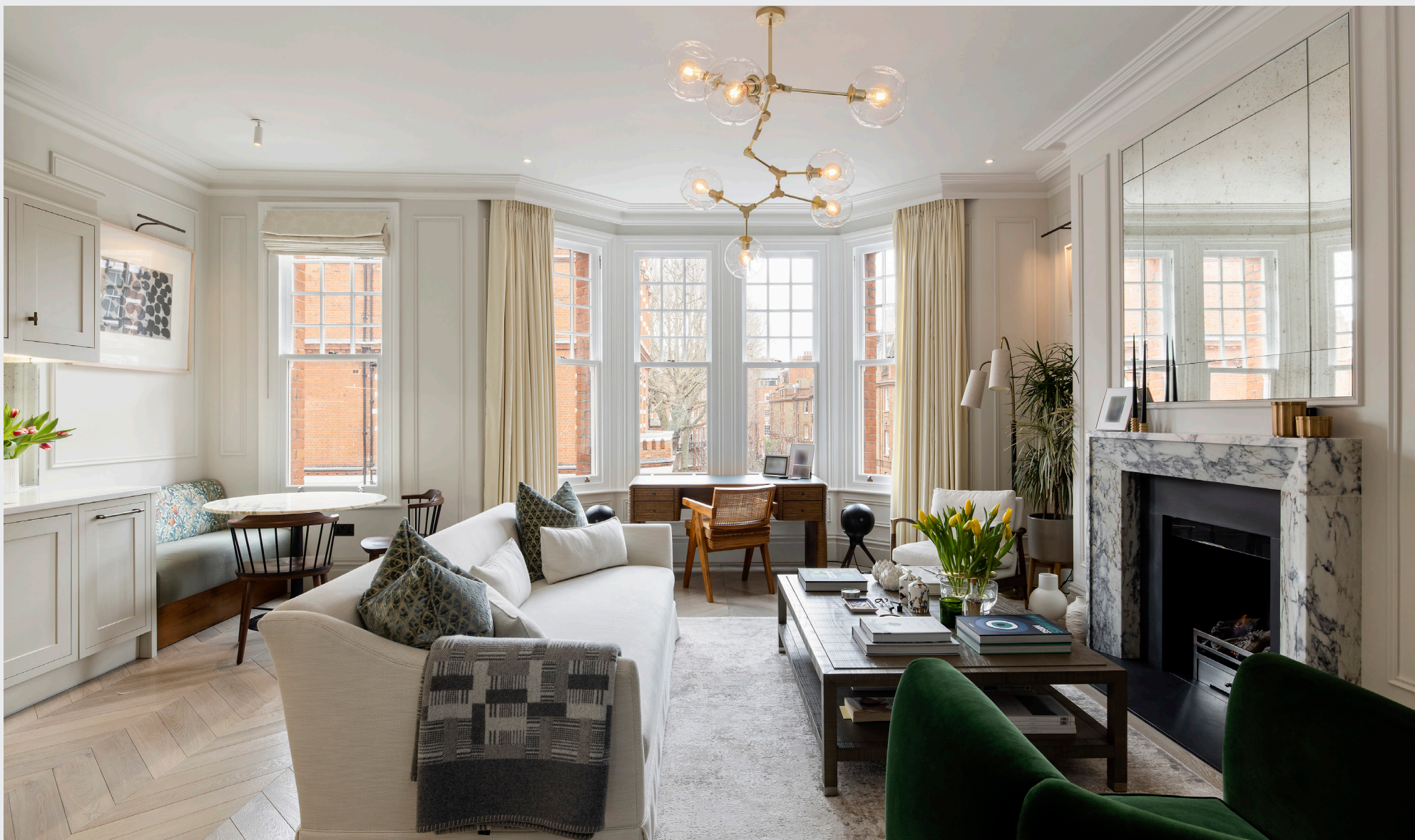
Egerton Gardens Knightsbridge, SW3